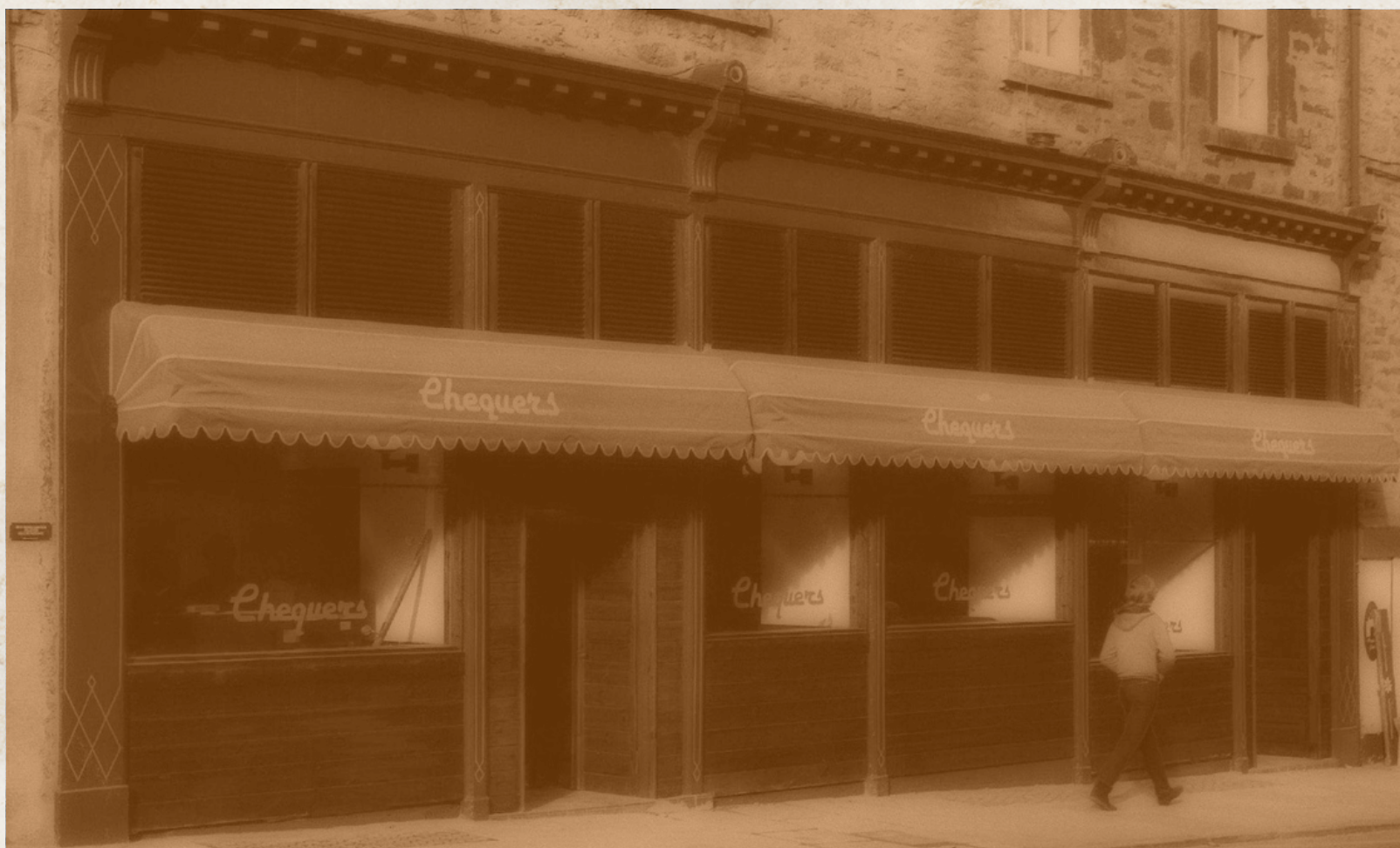
Pictured: 141 Nethergate as the former Chequers in 1981